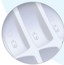
Labdisc charging pins