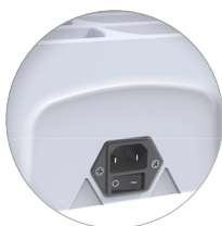
Single power entry

Continuing the success of the Labdisc Mobile Cart – Globisens is launching the Labdisc Charging Tray. This compact and cost effective charging station can store and charge up to 8 Labdiscs simultaneously.